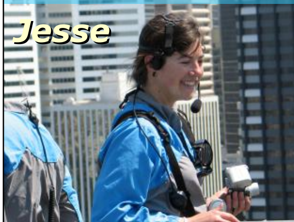
Climb Leader (Chapter 5 - 2007)